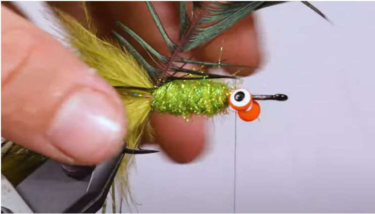
Add schlappen and legs