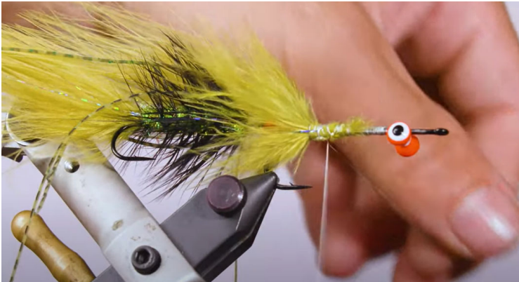
Add flash and wire