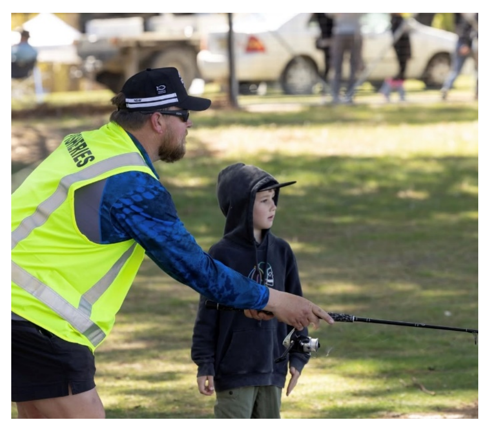
Gaden Staff helping out the fishcare volunteers on the fish out pond. The kids who attended loved the opportunity to catch their first trout!