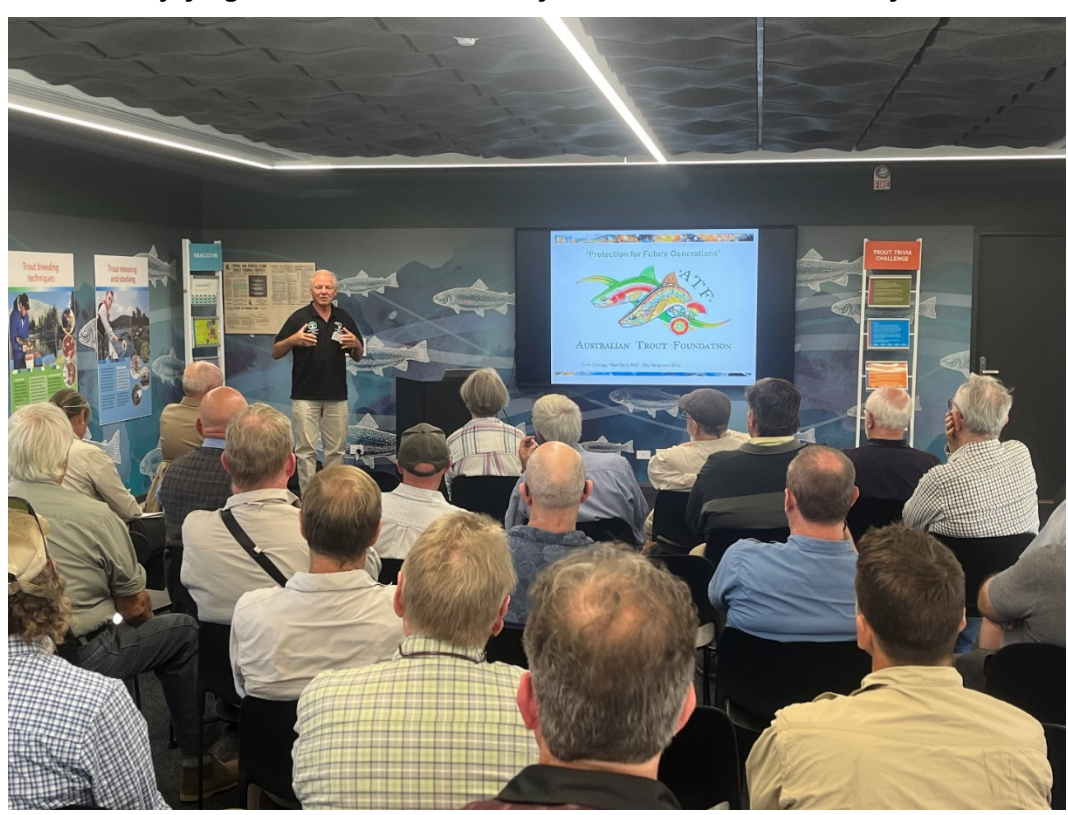
The Australian Trout Foundation gave a fantastic presentation which was very well received by attendees