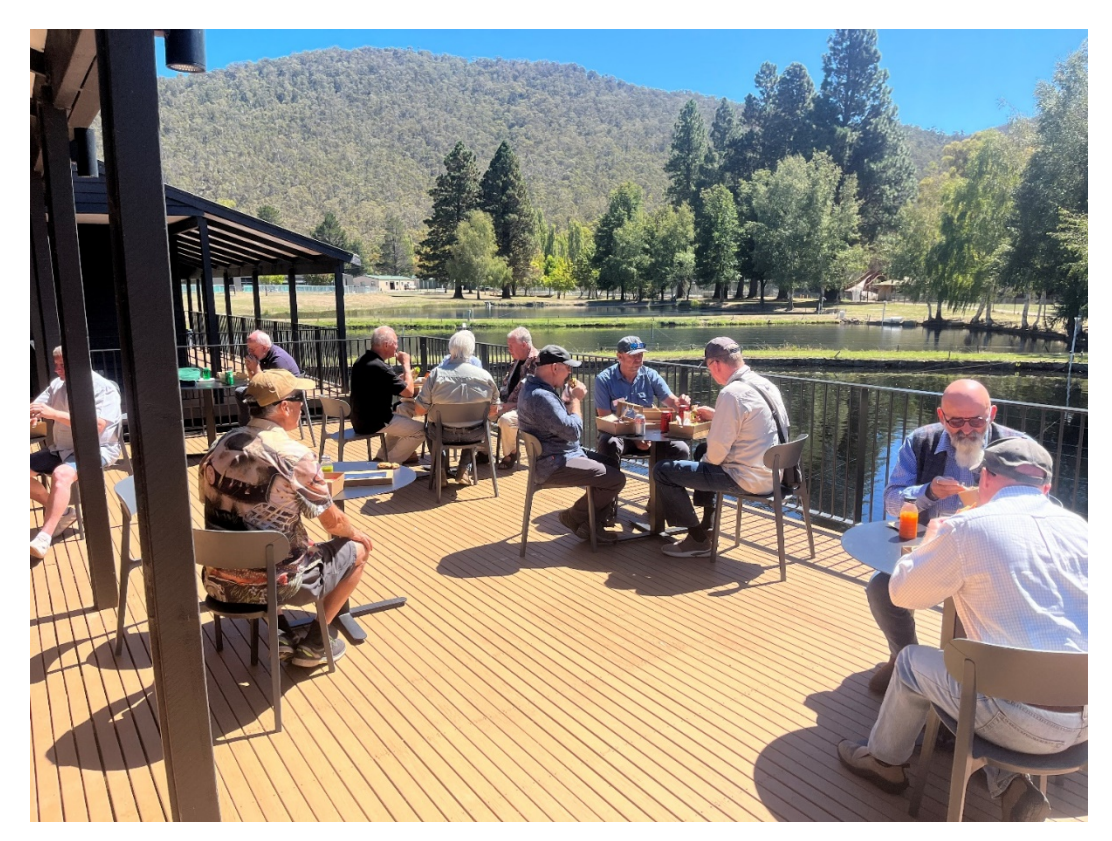
Guests enjoying their lunch on the newly built Gaden Tourist Facility Deck Area